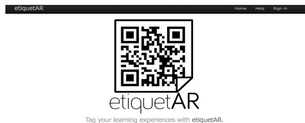
Fig. 1. etiquetar Web-based page. This page can be access at: http://www.etiquetar.com.es .